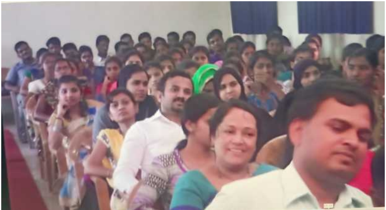
Delegates Present in Conference