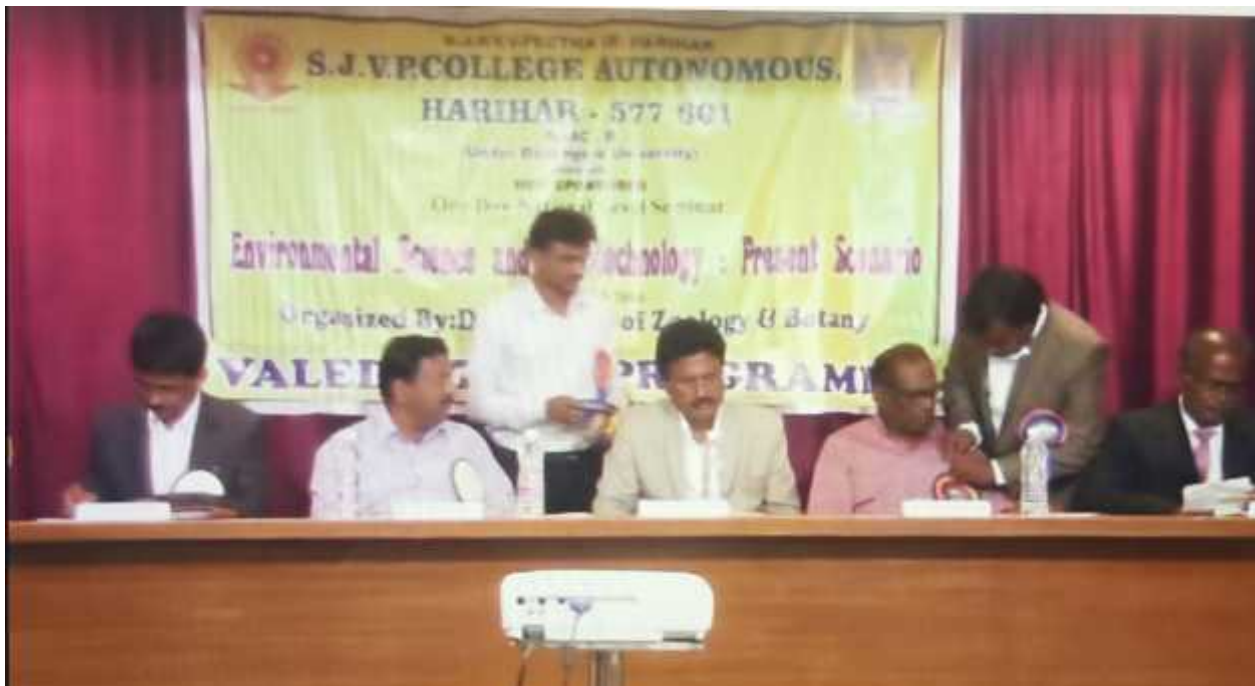
Chief Guests, Principal and Organizing Secretary Present Valedictory Programme Of National Conference