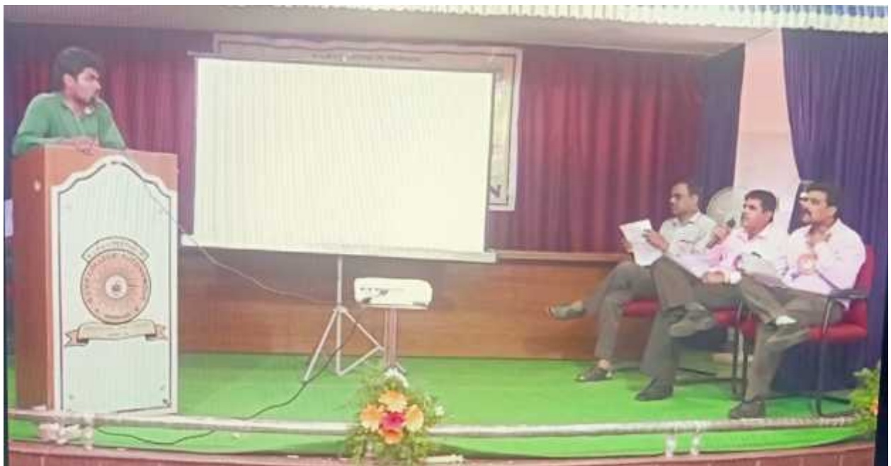
Research Scholars Delivered the Papers