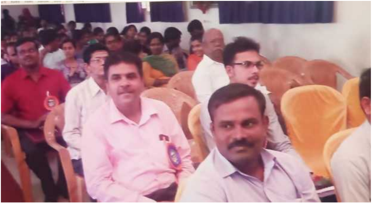
Delegates present in Conference