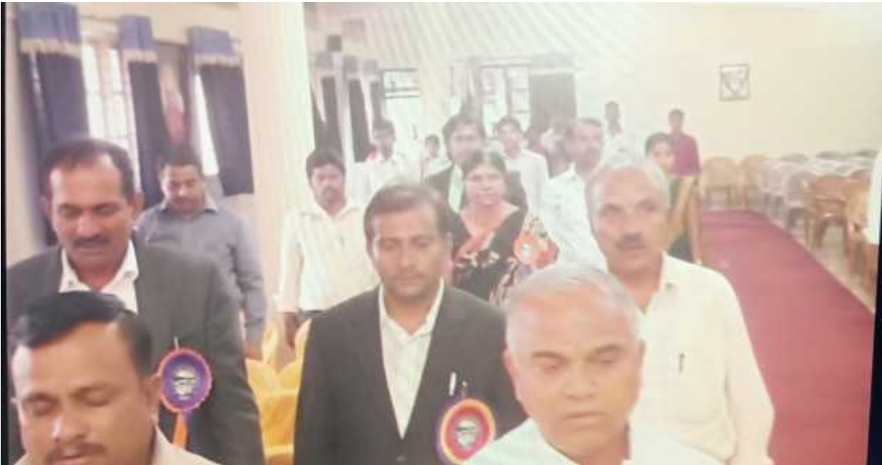
Management Vice-President, Staff Members and Delegates Present in Valedictory Programme